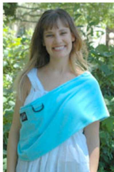
6. Sling on correctly