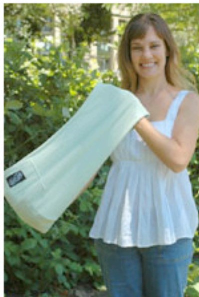
2. Sling folded and ready to put on