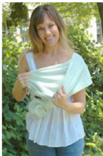
5. Pouch opening (where baby will go)