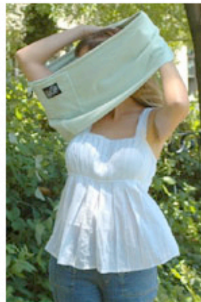
4. And over your head