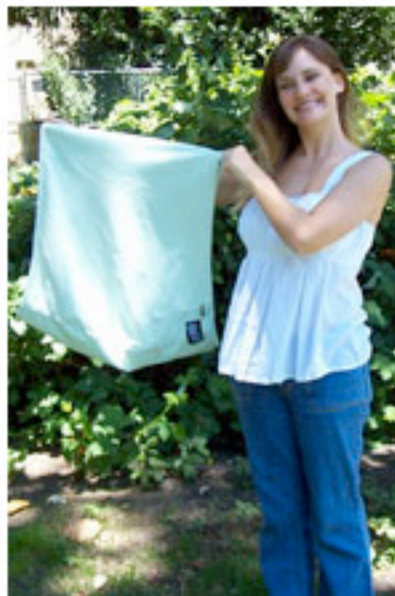
1. Sling open (not folded)